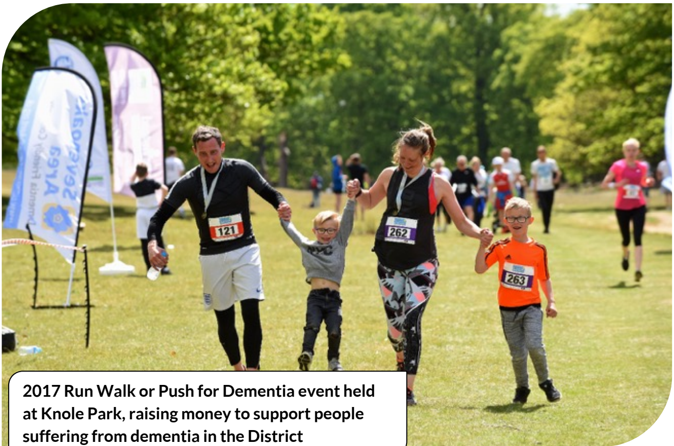
2017 Run Walk or Push for Dementia event held at Knole Park, raising money to support people suffering from dementia in the District

This Annual Report is produced by Sevenoaks District Council on behalf of the Sevenoaks District LSP using data and information provided by partners