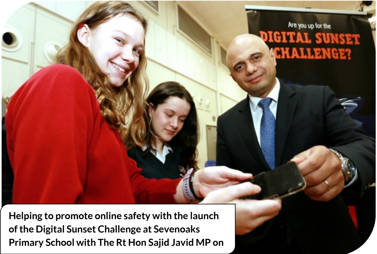
Helping to promote online safety with the launch of the Digital Sunset Challenge at Sevenoaks Primary School with The Rt Hon Sajid Javid MP on