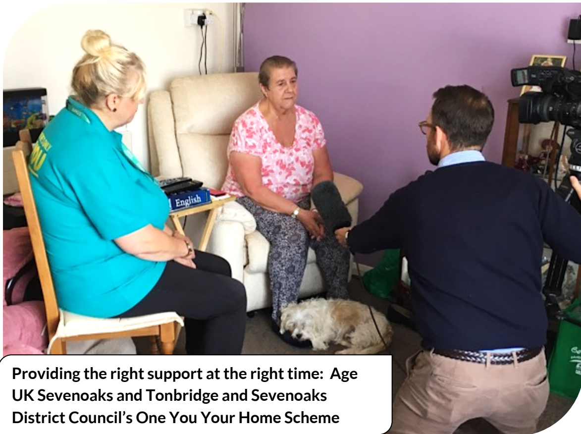
Providing the right support at the right time: Age UK Sevenoaks and Tonbridge and Sevenoaks District Council's One You Your Home Scheme

We want Sevenoaks to be a place where people can be supported to lead independent, fulfilling lives and where children and young people have the best start