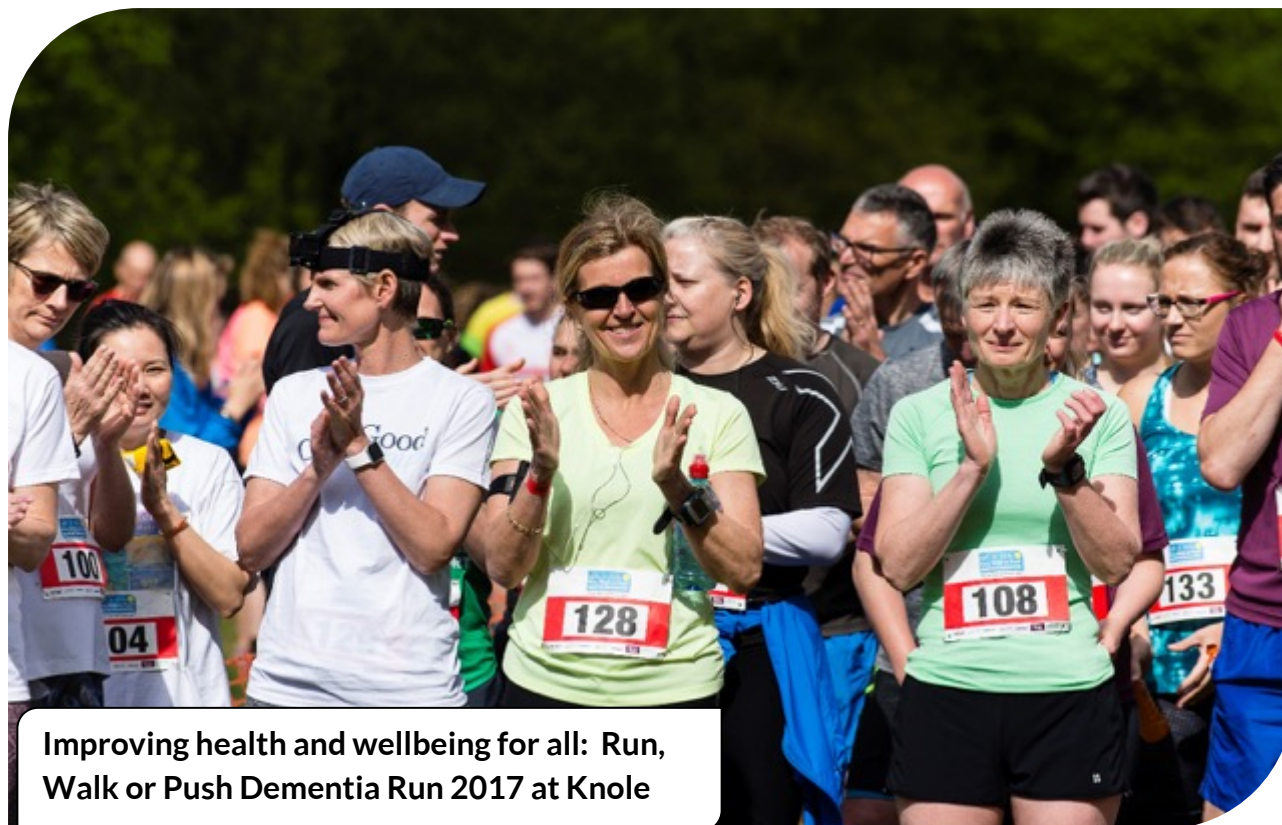
Improving health and wellbeing for all: Run, Walk or Push Dementia Run 2017 at Knole