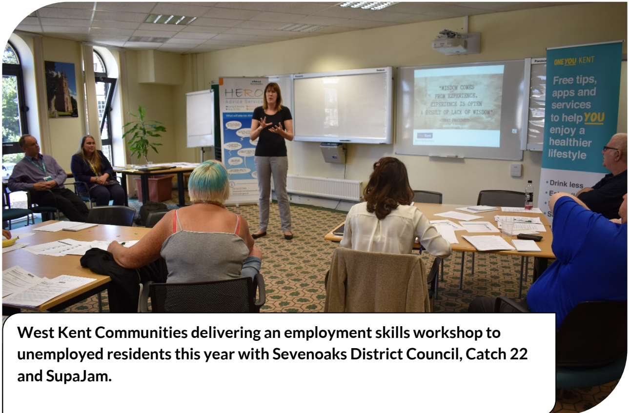
West Kent Communities delivering an employment skills workshop to unemployed residents this year with Sevenoaks District Council, Catch 22 and SupaJam.

We want Sevenoaks District to be a place with a thriving local economy, where businesses flourish, and people have skills for employment